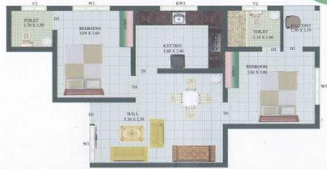
TYPE - D 964 SQFT (2 BHK)