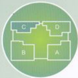
TYPE - C 1270 SQFT (3 BHK)